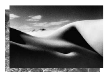
Hours of Operation Spa Facility: 6:30 a.m. to 9:00 p.m. Fitness Center: 6:30 a.m. to 9:00 p.m. Appointments available: 7:45 a.m. to 7:45 p.m.